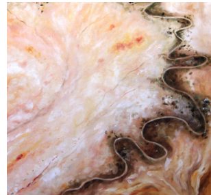
Heartland #7 (View from a plane #10) 2011, Oil on canvas 61cm x 61cm