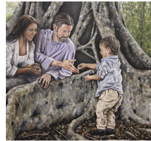
Entwined/Legacy (Always forever #3) 2017, Oil & acrylic on canvas 122cm x 91cm