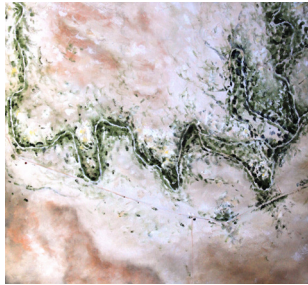
Heartland #6 (View from a plane #9) 2011, Oil on canvas 61cm x 61cm