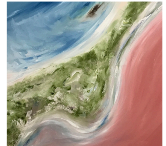
Heartland #8 (View from a plane #11) 2017, Oil on canvas 61cm x 61cm