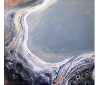
Heartland #4 (View from a plane #7) 2011, Oil on canvas 61cm x 61cm