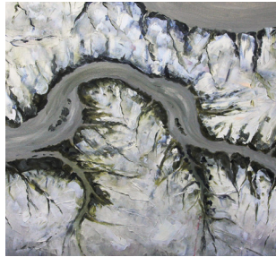
Heartland #1 (View from a plane #4) 2010, Oil on canvas 61cm x 61cm

Unlike other works that required intensive concentration and patience, the Heartland works provided release and allowed me the freedom to explore and find both renewed energy and peace.