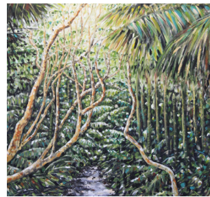
Journey's start/Through the eyes of the lover (Lord Howe Island) 2012, Oil & acrylic on canvas 101.6cm x 76.2cm