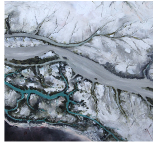
Heartland #2 (View from a plane #5) 2011, Oil on canvas 61cm x 61cm