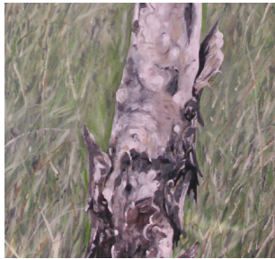
Shedding Skin #2 (Blue Mountains) Undated, Oil & acrylic on canvas 76cm x 61cm