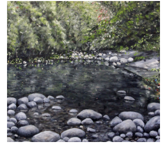
Upstream/The Future (Daintree) 2011-17, Oil & acrylic on canvas 91cm x 60cm