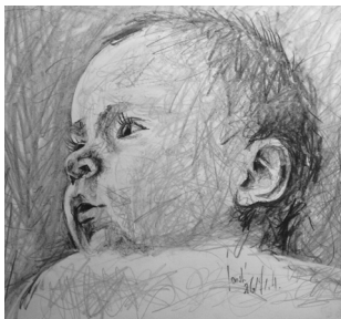
Comfort #3 (6 months) 2014, Pencil on paper 32cm x 45cm