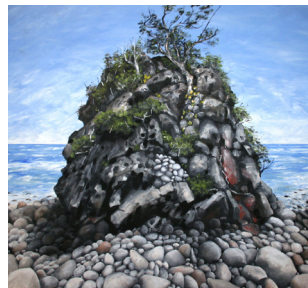
Refuge #2 (Lord Howe Island) 2010, Oil & acrylic on canvas 90cm x 90cm