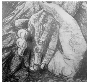
Legacy #2 2017, Pencil on paper 32cm x 45cm