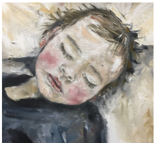
Shining Sun (20 months) 2015, Oil on canvas 30cm x 25cm