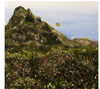
The Perch/Looking upon the lover (Lord Howe Island) 2010, Oil & acrylic on canvas 40cm x 120cm