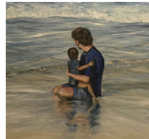
Close distance 2016, Oil on canvas 114.5cm x 72.5cm