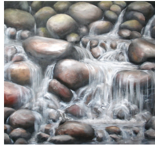
After the rain/Turmoil (Daintree) 2008-14, Oil on canvas 60cm x 91cm