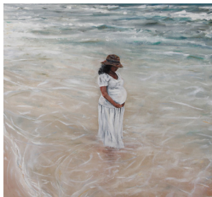
Beginnings (The found child) 2015, Oil on canvas 114.5cm x 72.5cm

They depict my journey over the last 10 years: in finding love, starting a family, facing struggle and challenge, and discovering peace.