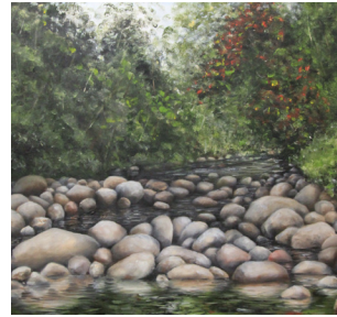
Downstream/The Past (Daintree) 2008, Oil & acrylic on canvas 91cm x 60cm