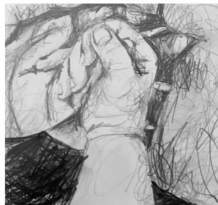
Legacy #3 2017, Pencil on paper 32cm x 45cm