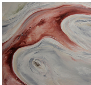
Heartland #9 (View from a plane #12)