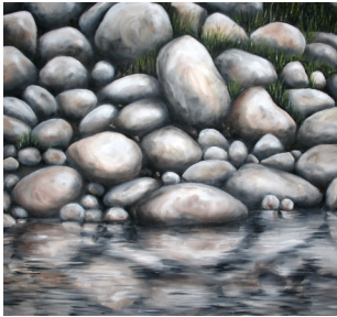
Before the rain/Tranquility (Daintree) 2008, Oil & acrylic on canvas 60cm x 91cm