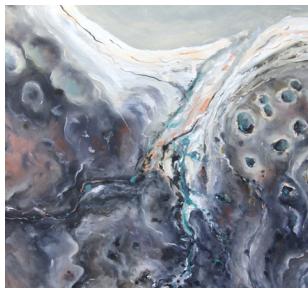
Heartland #5 (View from a plane #8)