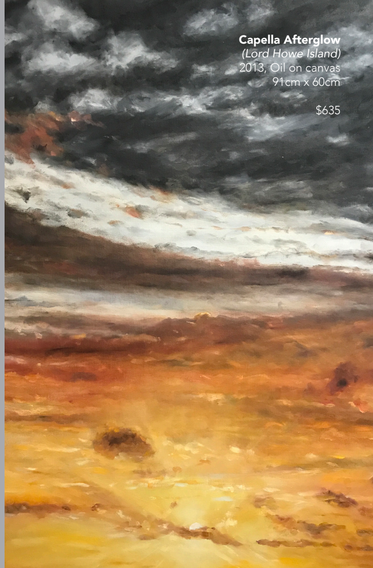
Capella Afterglow (Lord Howe Island) 2013, Oil on canvas 91cm x 60cm

The works are inspired by four key locations: - The Daintree region; - The Blue Mountains; - Central Australia; and - Lord Howe Island